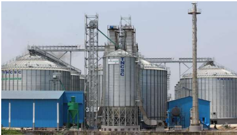
SILo Storage for paddy (50,000 MT) constructed at Erukkur Village, Sirkazhi Taluk in Nagapattinam District