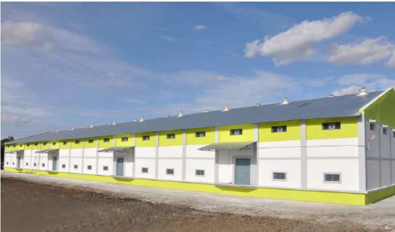
Aruppukkottai Warehouse, Virudhunagar District.