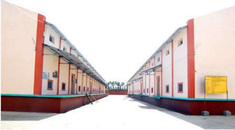
Nanjikottai Warehouse, Thanjavur District.