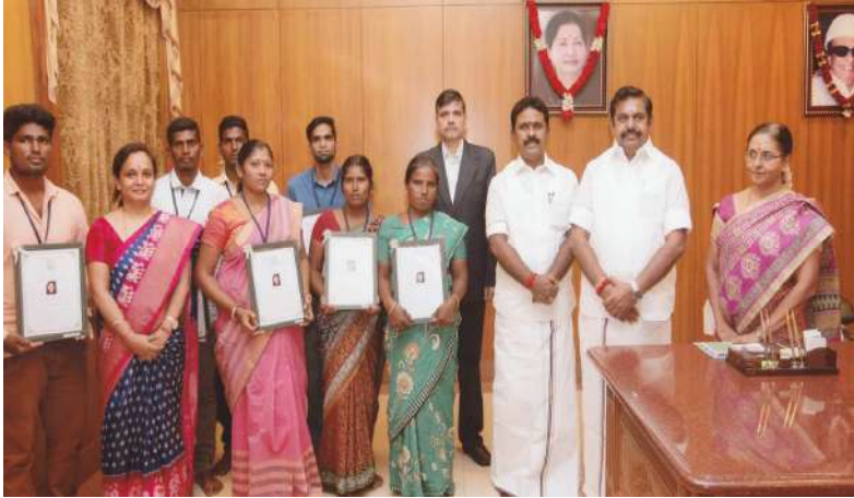
Hon'ble Chief Minister of Tamil Nadu issued 31 Compassionate grounds appointments in Tamil Nadu Civil Supplies Corporation on 13.10.2017