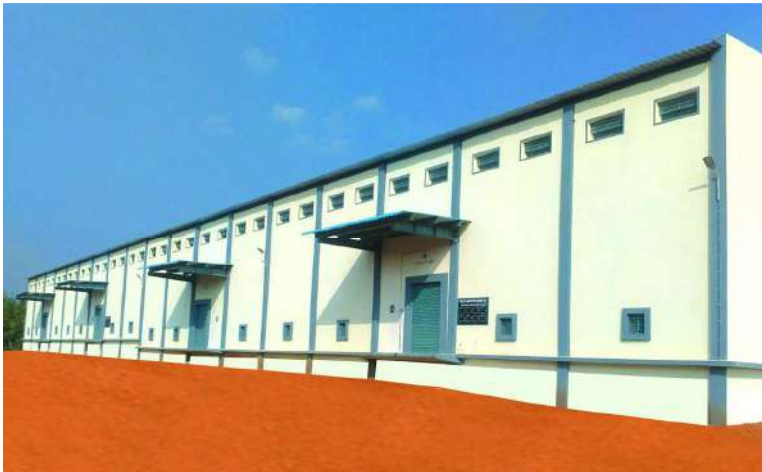
2000 MT Capacity of Godown at Athani Village, Anthiyur Taluk in Erode District