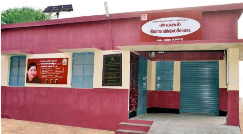
Amutham Retail Shop at Vyasarpadi in Chennai