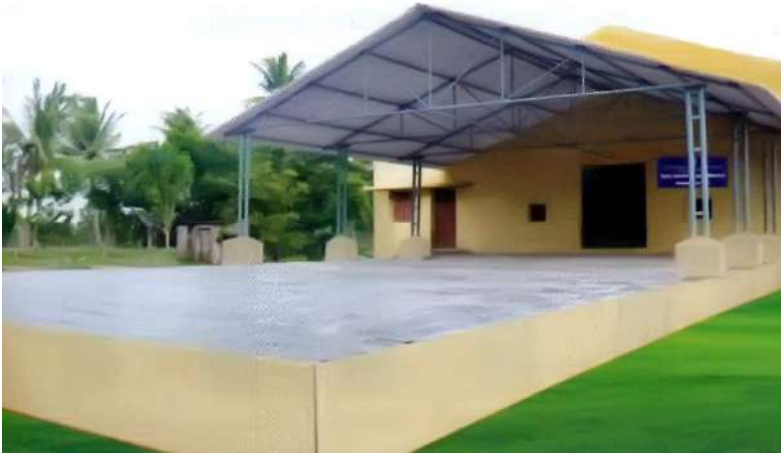
Direct Purchase Centre at Akkaraikottai Village in Thiruvallur District