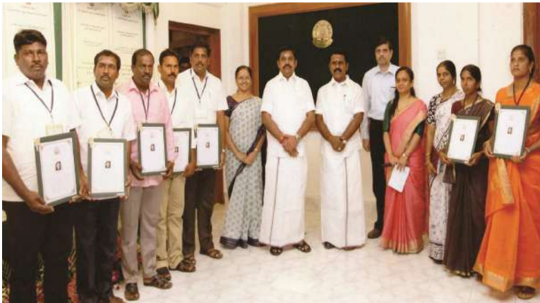
Hon'ble Chief Minister of Tamil Nadu has issued 20 Compassionate grounds appointments to the legal heir of the deceased employees of TNCSC and appointment order to seasonal bill clerk and helper who were worked in DPC of TNCSC on 04.06.2018