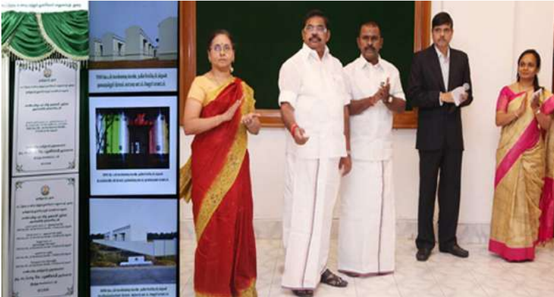
Hon'ble Chief Minister of Tamil Nadu inaugurated 15 Godowns Constructed at Nagapattinam, Vellore and Erode Districts.