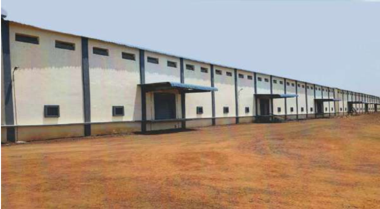
5000 MT Capacity of Godown at Irumbuthalai Village, Papanasam Taluk in Thanjavur District