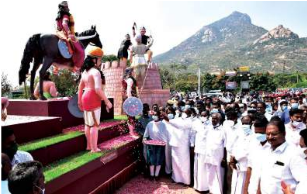
Republic Day float given a warm welcome by showering flowers (Tiruvannamalai, 17.2.2022).