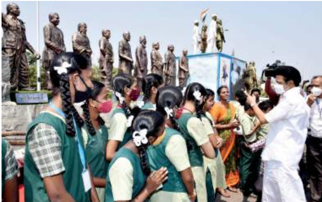
Hon'ble Chief Minister of Tamil Nadu Thiru.M.K.Stalin interacted with students who had come to witness the Republic Day floats (Chennai, 21.2.2022).