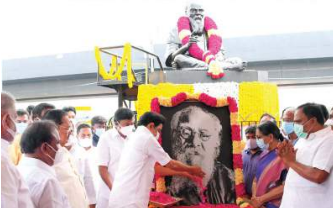
Hon'ble Chief Minister of Tamil Nadu Thiru.M.K.Stalin paid floral tributes to the portrait of Thanthai Periyar (Chennai, 17.9.2021).