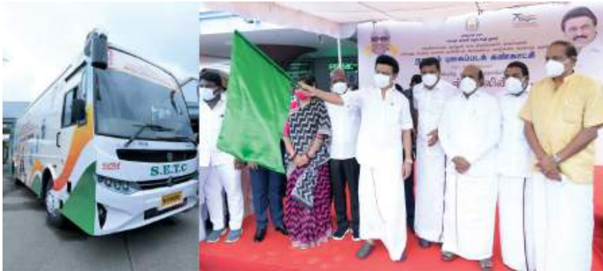
Hon'ble Chief Minister of Tamil Nadu Thiru.M.K.Stalin flagged off the mobile photo exhibition bus to mark the 150 th birth anniversary of V.O.Chidambaranar (Chennai, 1.11.2021).