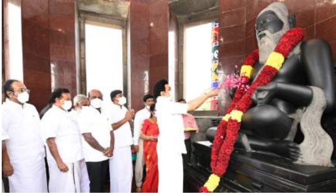
Hon'ble Chief Minister of Tamil Nadu Thiru.M.K.Stalin paid floral tributes to the statue of Iyyan Thiruvalluvar on Thiruvalluvar Day (Chennai, 15.1.2022).