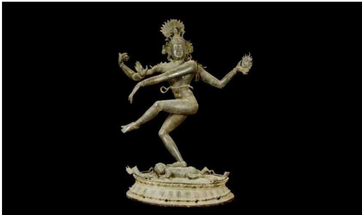
Tiruvalangadu Nataraja Bronze, 11 th Century A.D., Government Museum, Egmore, Chennai.