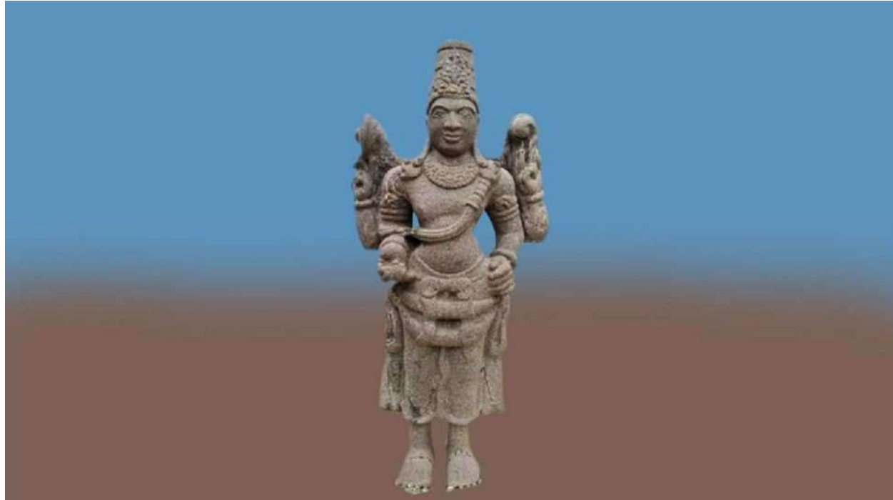
Srinivasa, Stone Sculpture, 9 th Century A.D. Government Museum, Kanniyakumari