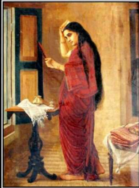
'Lady with Mirror' - Oil painting by Raja Ravi Varma, Government Museum, Egmore, Chennai