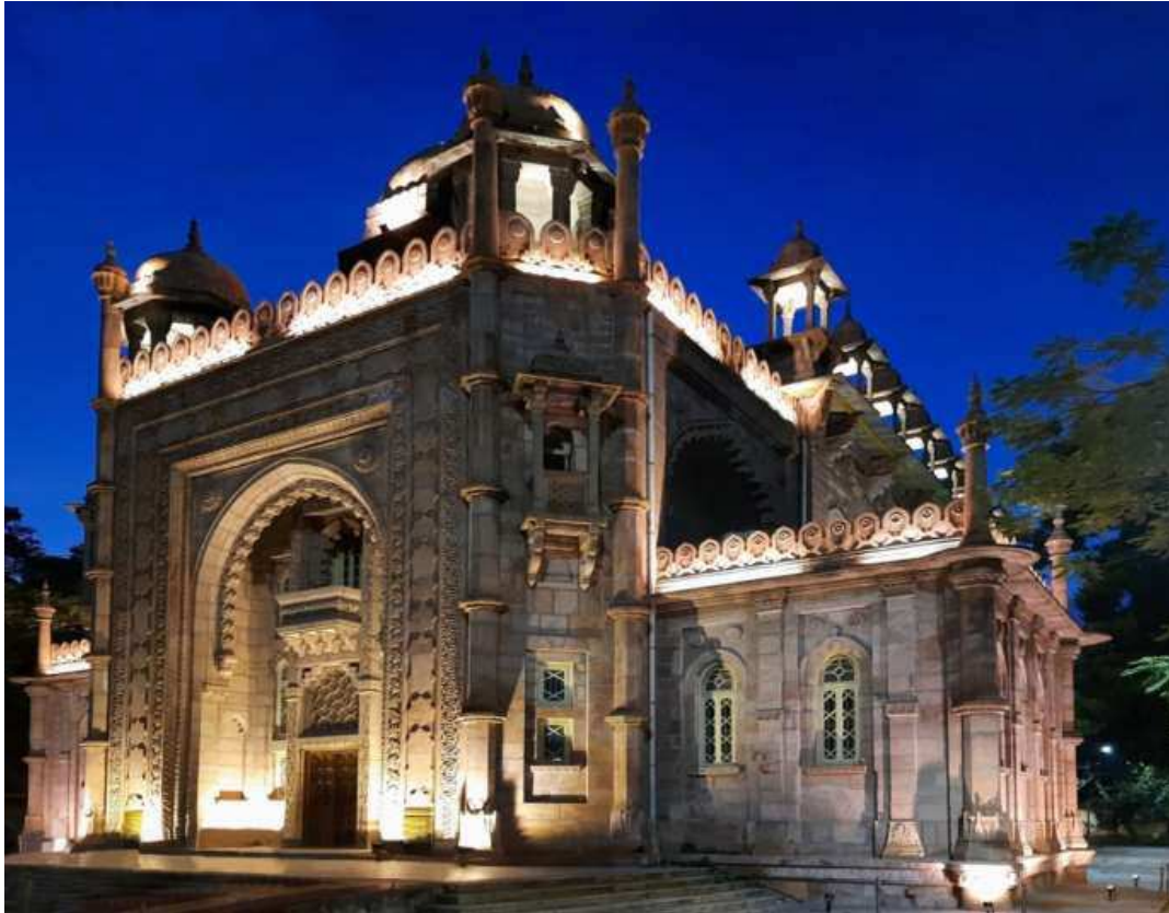
Illuminated external view of the Refurbished National Art Gallery , Inaugurated by the Hon'ble Minister for Tamil Development and Information on 06.02.2024