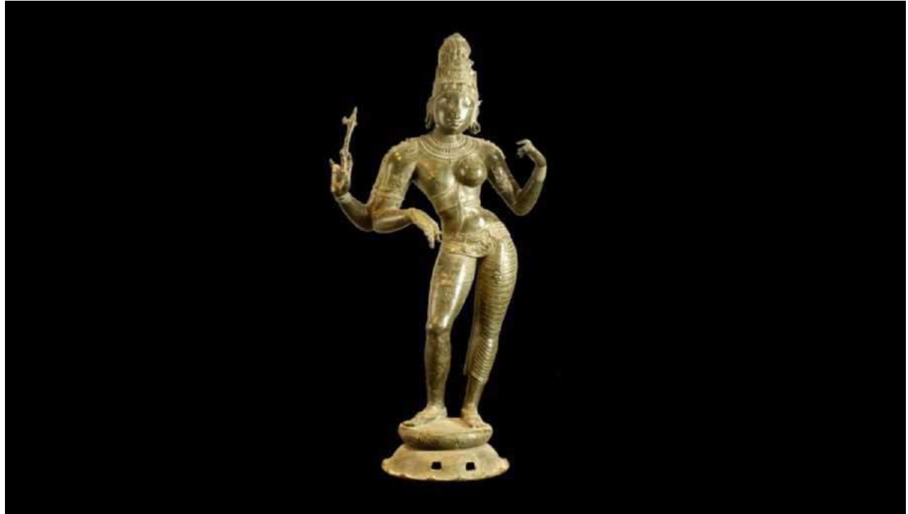
Tiruvankadu Arthanareeswarar Bronze – 11 th Century A.D., Government Museum, Egmore, Chennai