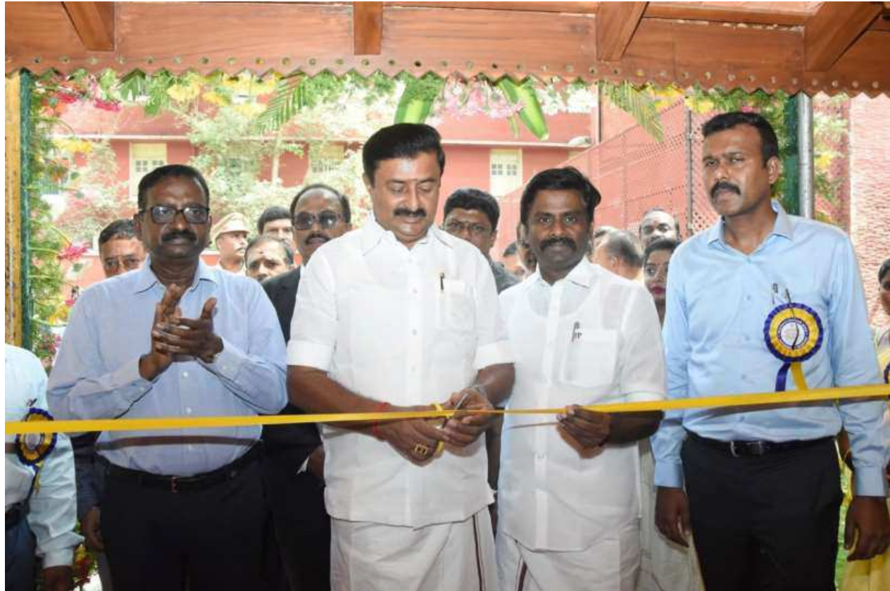
Hon'ble Minister for Tamil Development and Information inaugurated the Refurbished Heritage Building for a Vintage Cafeteria on 06.02.2024, Government Museum, Egmore, Chennai