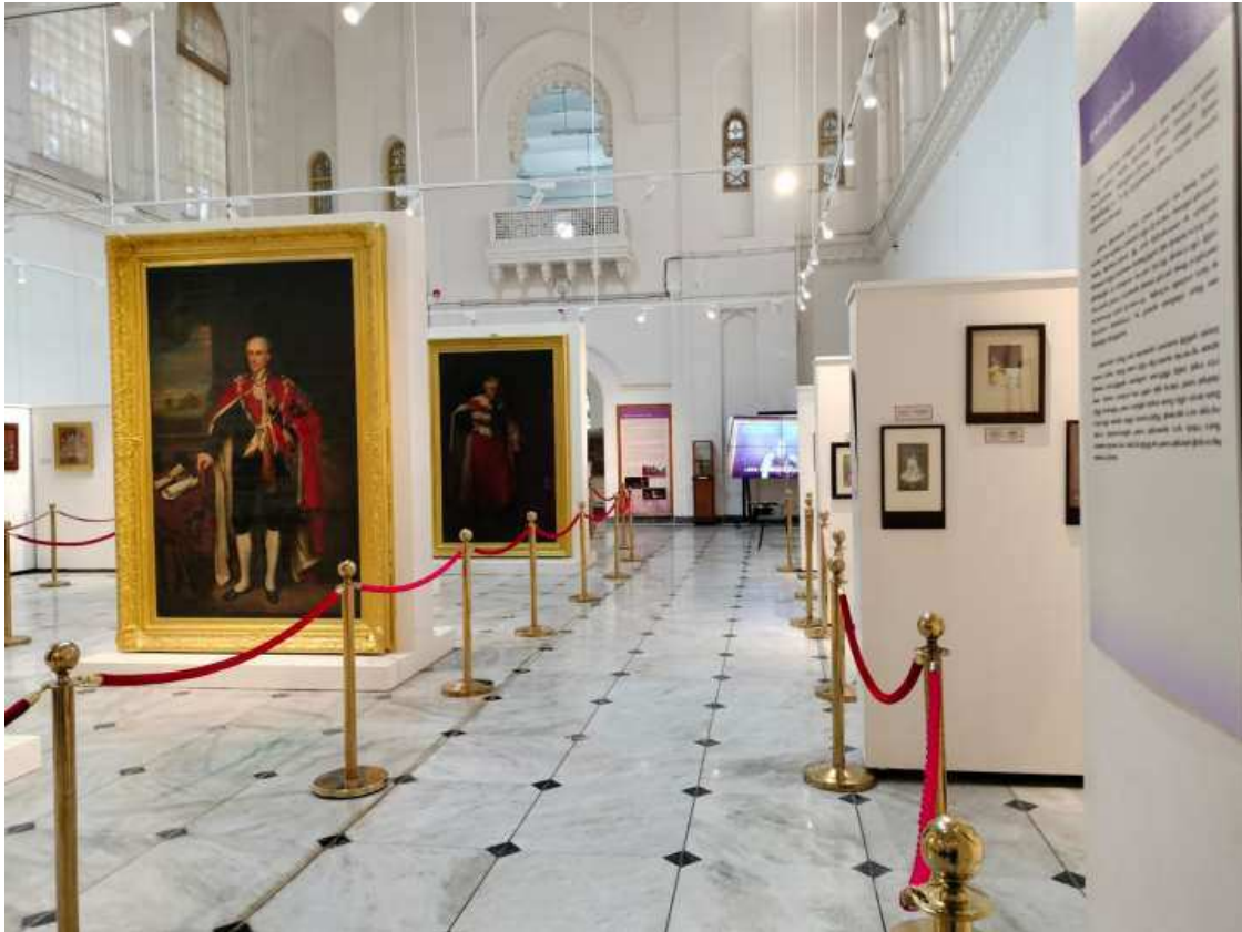
Interior view of the Refurbished National Art Gallery, Government Museum, Egmore, Chennai