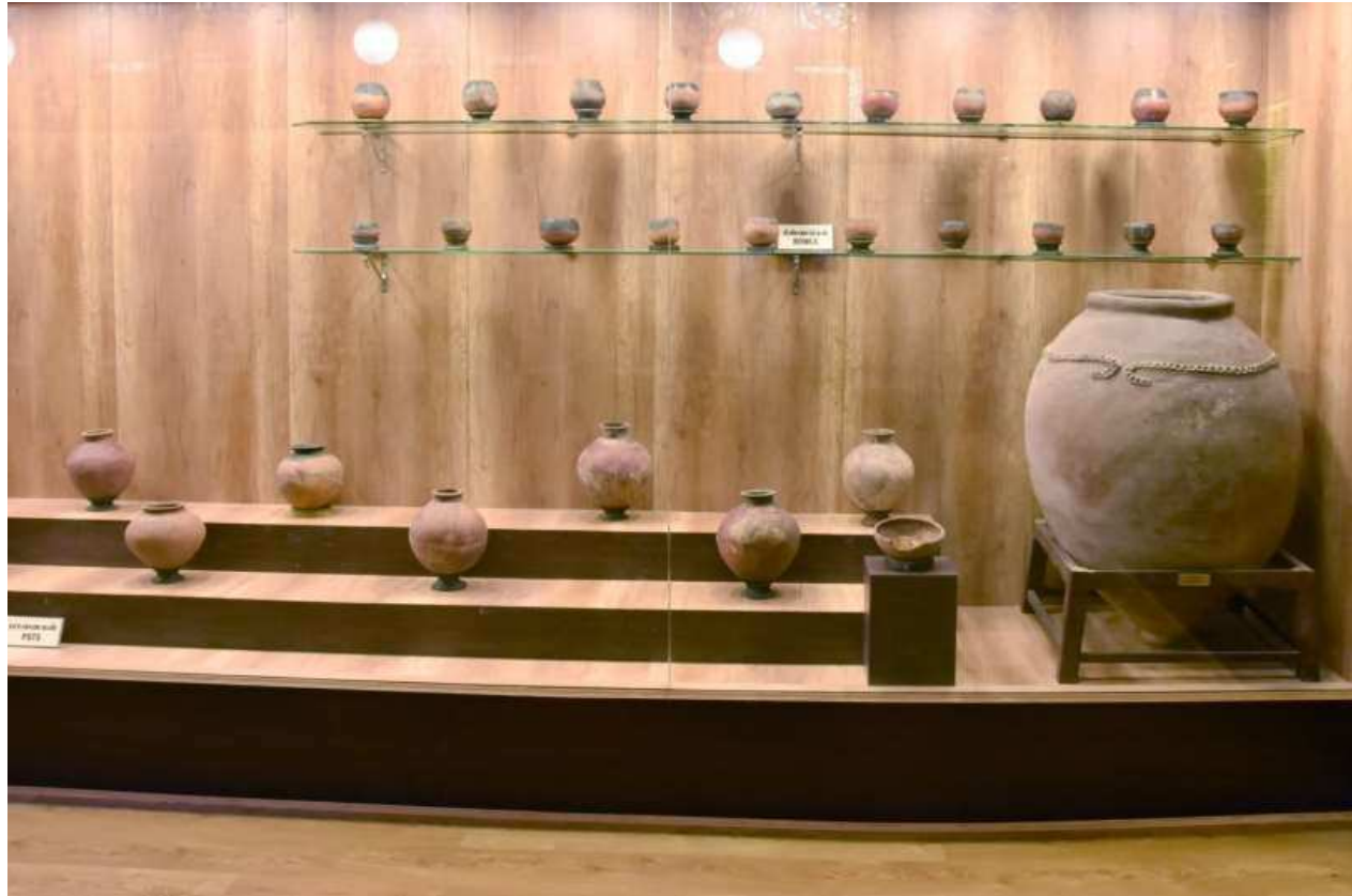
Part of the Pre-history Gallery with Aadichanallur Artefacts Government Museum, Egmore, Chennai