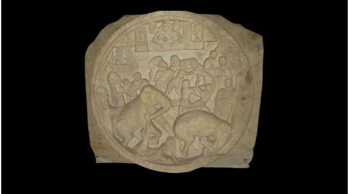
Amaravati Sculpture, 1 st Century A.D., Government Museum, Egmore, Chennai