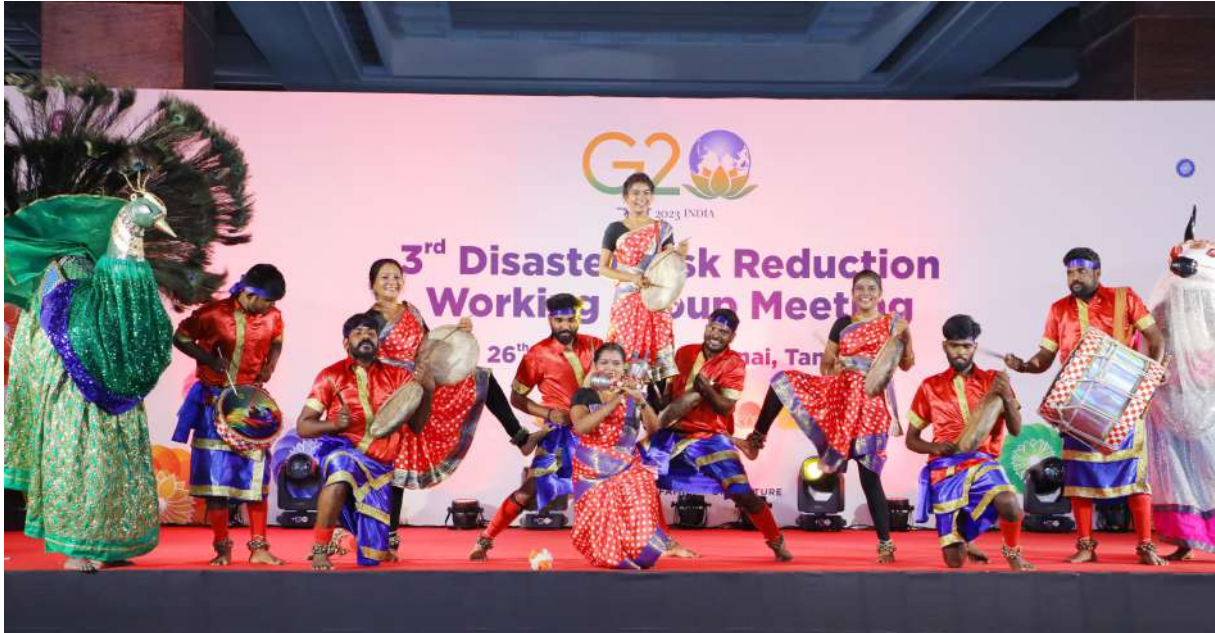
Folk art programmes were organized by the Department of Art and Culture in the G-20 conference held in Chennai on 24.07.2023.