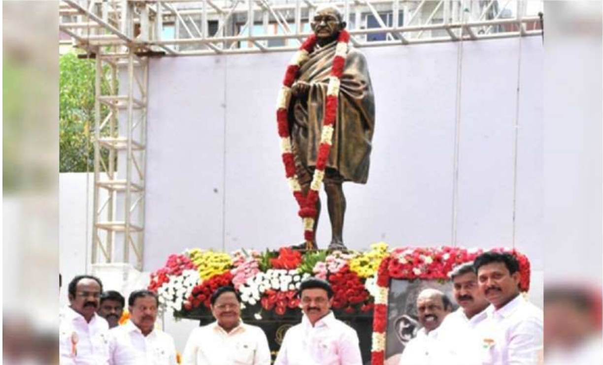
Hon'ble Chief Minister of Tamil Nadu Garlanded the Mahatma Gandhi Statue at the premises of Government Museum, Egmore, Chennai on the occasion of Gandhi Jayanti