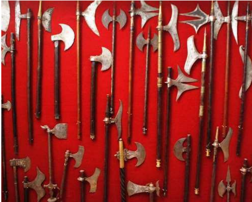
Various type of Axes, Thanjavur Armouries, Government Museum, Egmore, Chennai