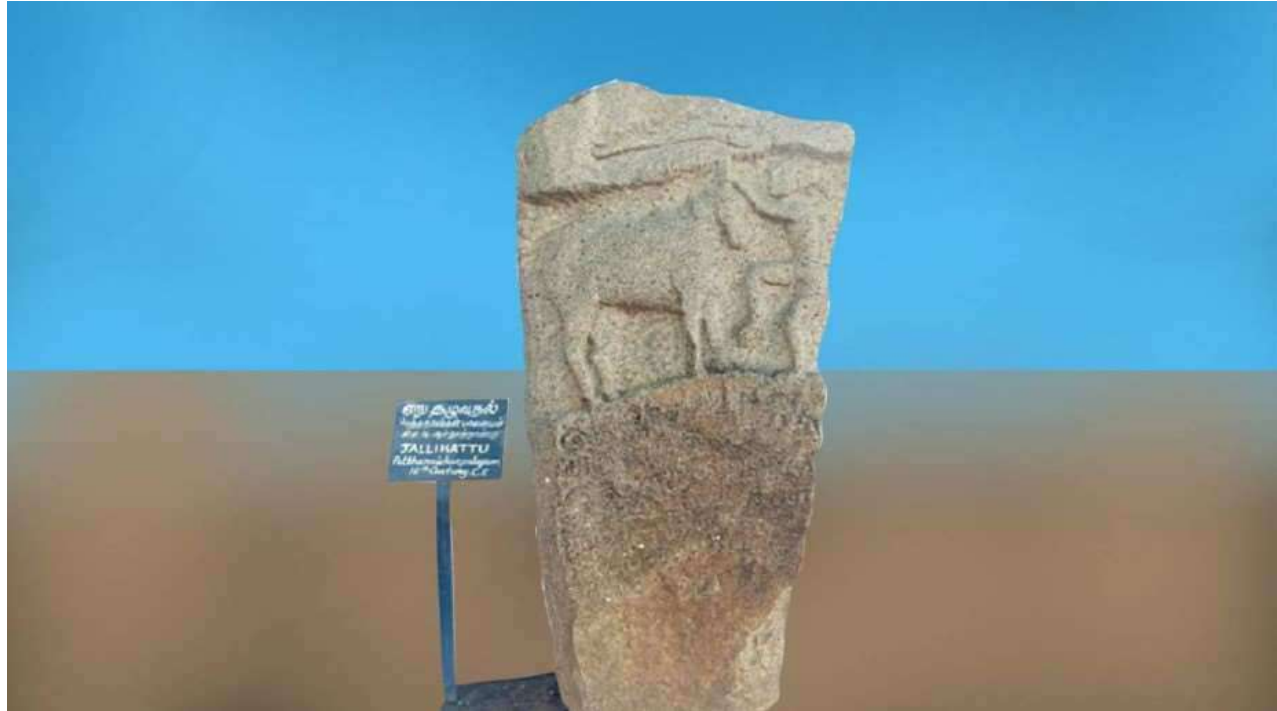
Jallikattu Veerakkal (Hero Stone), 16 th Century A.D. Bethnayakan Palayam-Salem, Government Museum, Salem