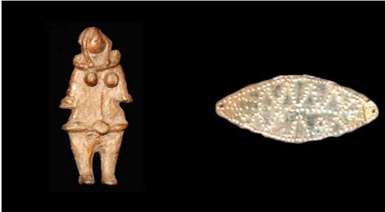
3000 years old 'Mother Goddess' bronze image and a gold diadems of Aadichanallur -1904, the First Excavation in India Government Museum, Egmore, Chennai.