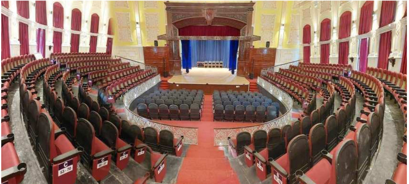
Interior view of the Refurbished Museum Theatre, Government Museum, Egmore, Chennai