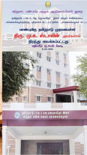
Additional building for Tamil Nadu Dr J.Jayalalithaa Music and Fine Arts University at a cost of Rs.14.85 crore was virtually inaugurated by the Hon'ble Chief Minister of Tamil Nadu on 08.03.2024.