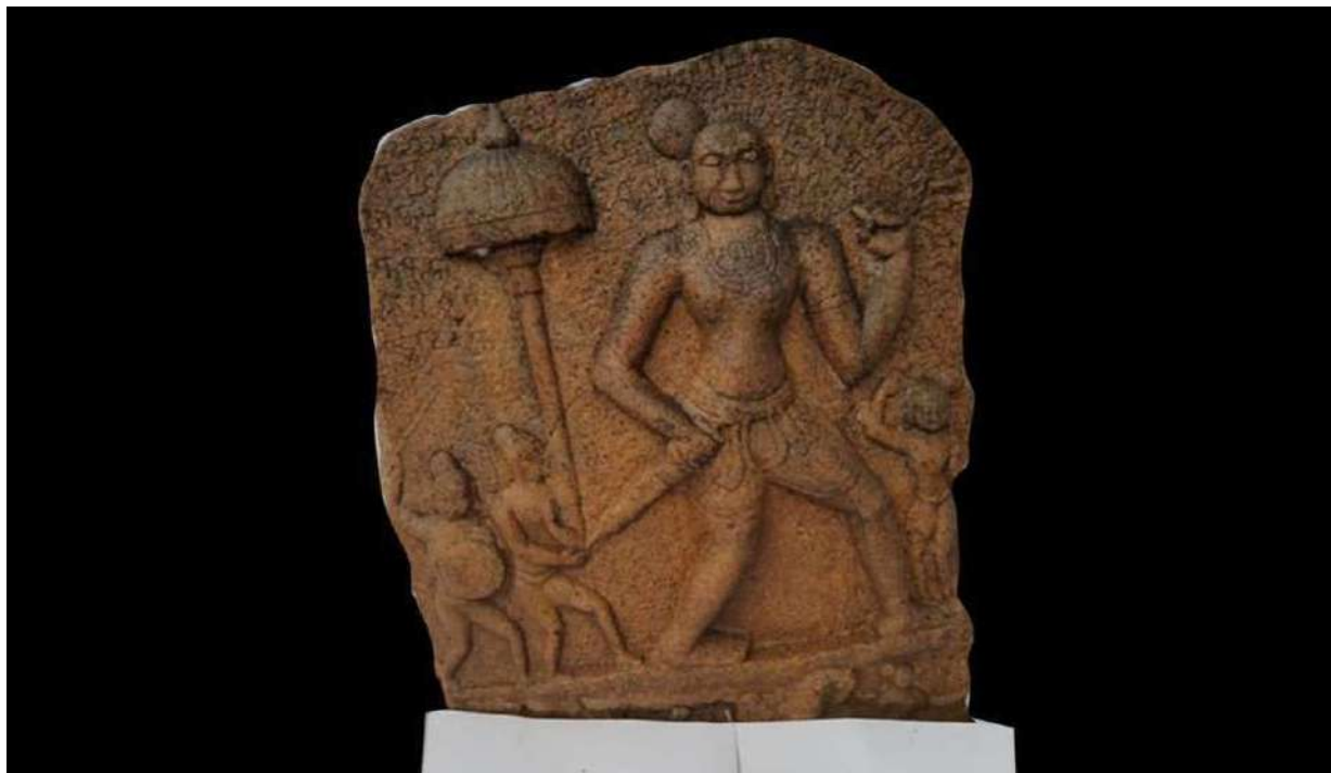
Hero Stone of 13 th Century A.D. from Tiruchengodu - Namakkal District Government Museum, Salem