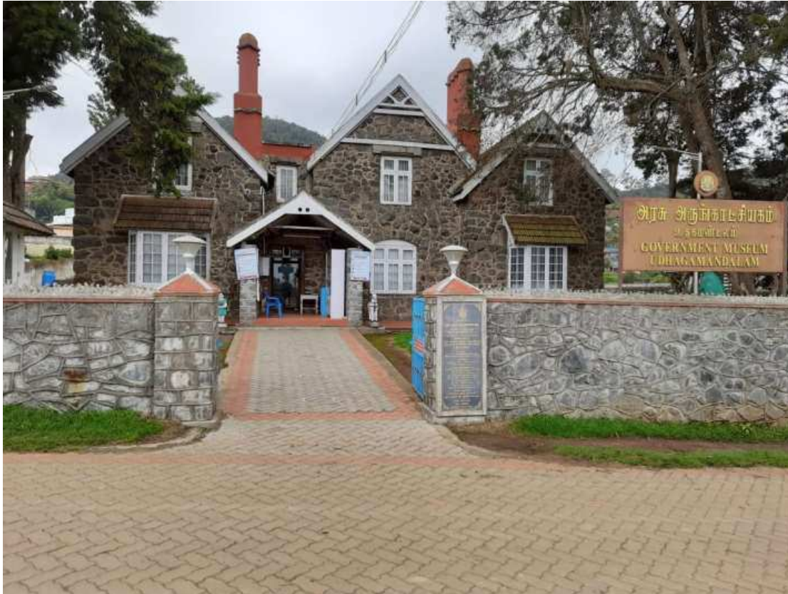
A view of the Government Museum, Udhagamandalam at the 'Stone House' – the first heritage structure of Udhagamandalam