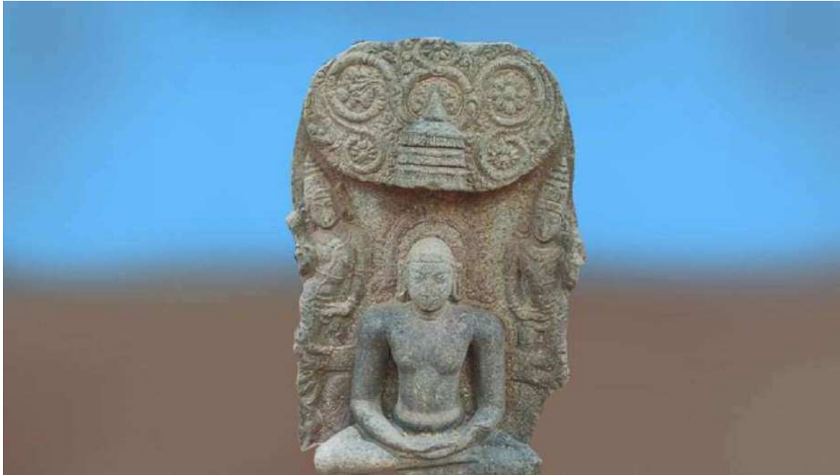
Mahavira (Stone sculpture), 10 th Century A.D. - Mullikaruppur, Government Museum, Tiruchirappalli