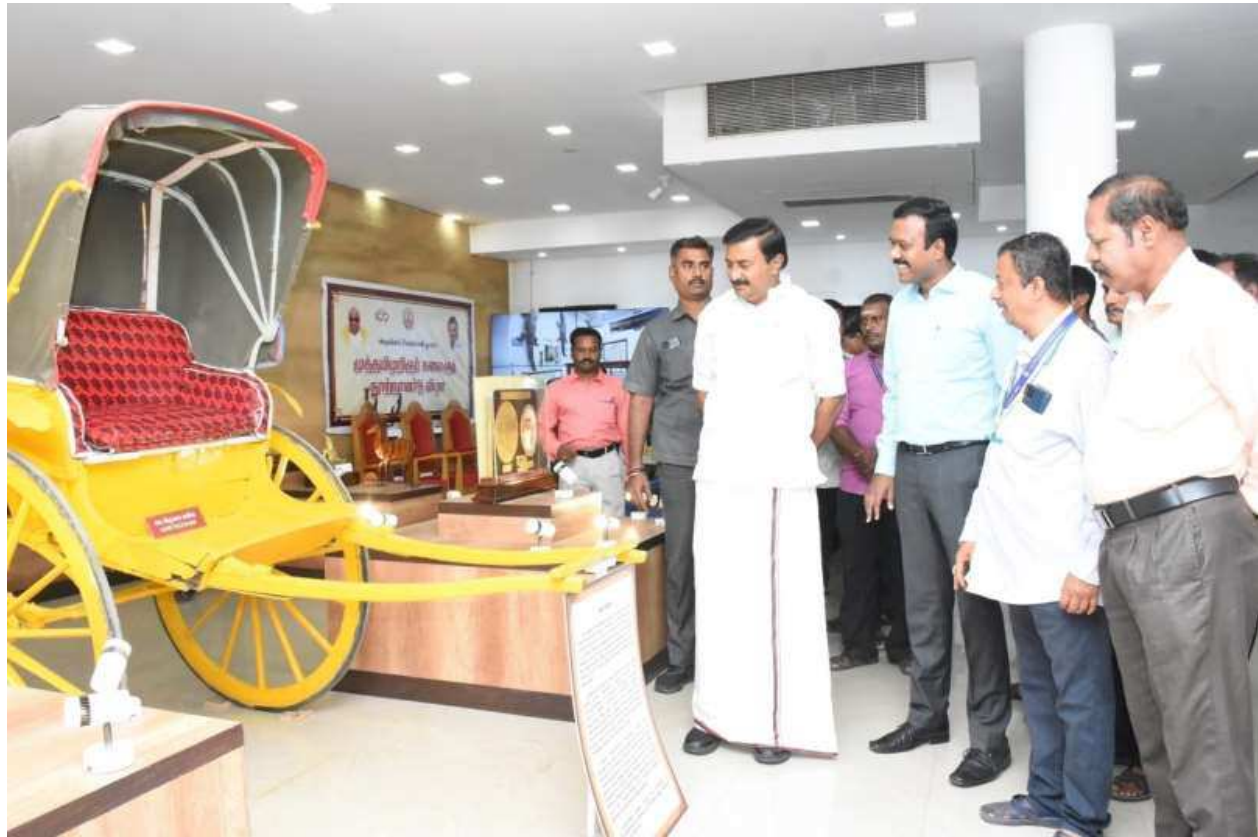
Hon'ble Minister for Tamil Development and Information inaugurated the 'Muthamil Arignar Kalaighar Centenary Exhibition' on 05.09.2023 and visited the Hand-rickshaw abolished by Kalaighar