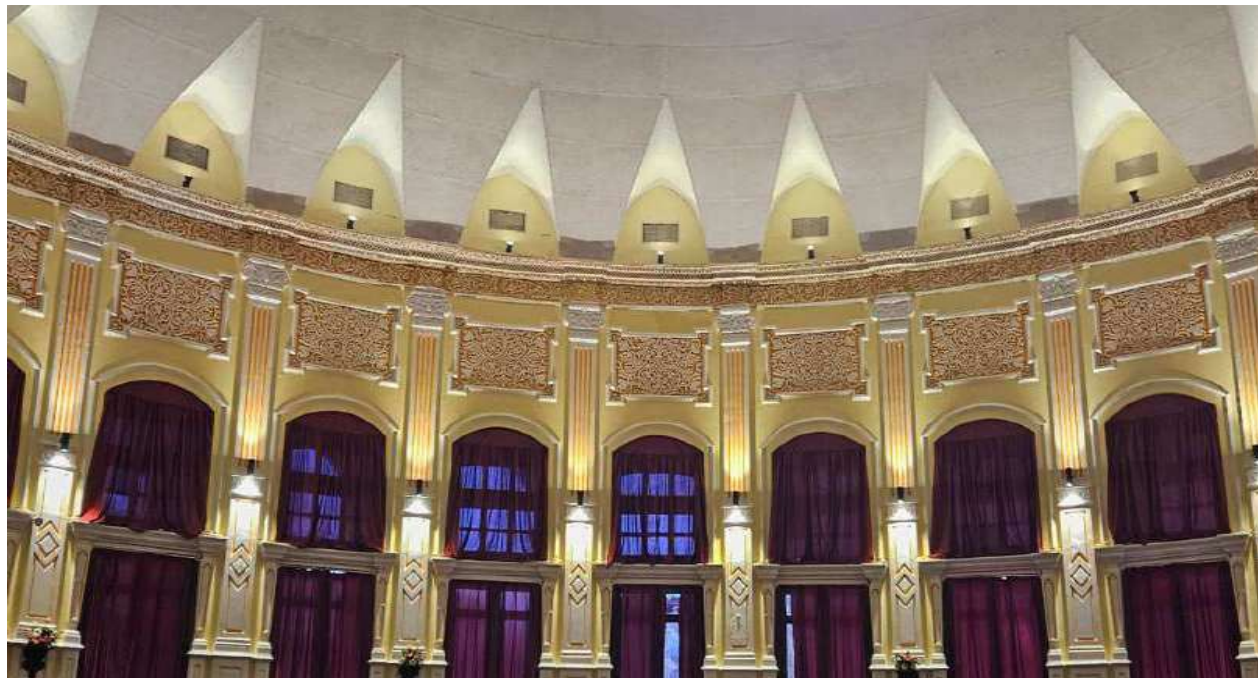
Illuminated interior view of the Museum Theatre, Government Museum, Egmore, Chennai