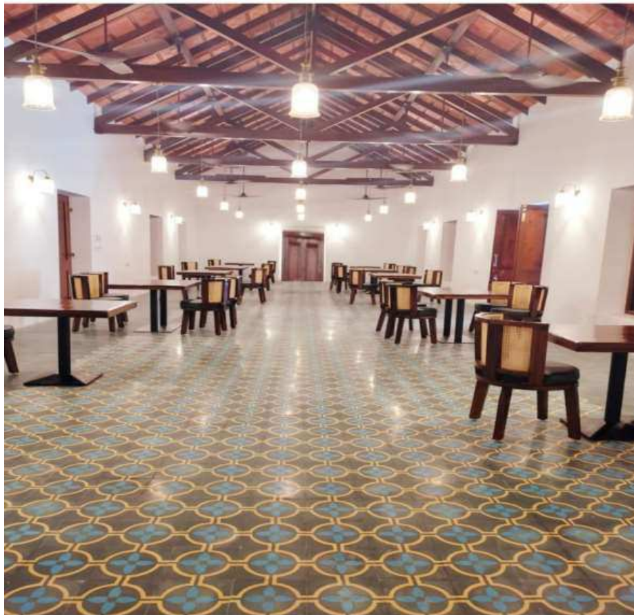
Interior view of the Vintage Cafeteria, Government Museum, Egmore, Chennai