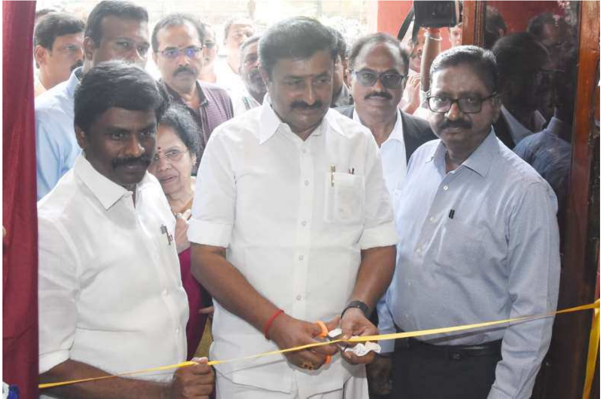
Hon'ble Minister for Tamil Development and Information inaugurated the Refurbished Museum Theatre on 06-02-2024 at Government Museum, Egmore, Chennai