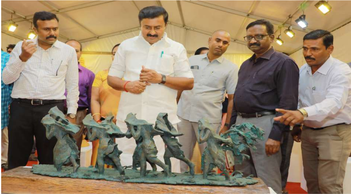
The Hon'ble Minister for Tamil Development, Information and Publicity inaugurated the state level Painting – Sculpture exhibition in Chennai Museum on 10.10.2023.