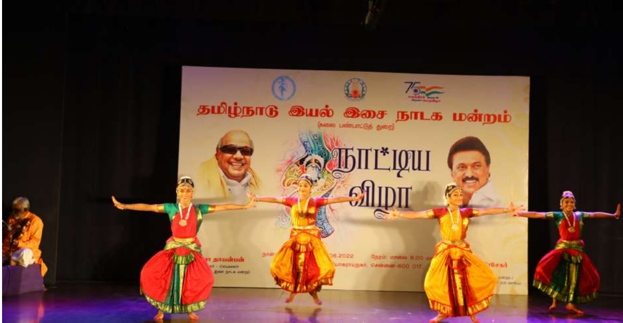
Tamil Nadu Eyal Isai Nataka Manram organized 'Dance festival' in commemoration of World Dance Day on 19.08.2023 in Chennai.