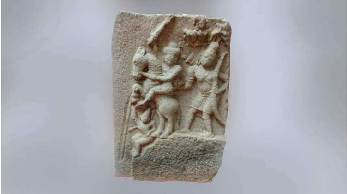
Hero Stone of 16 th Century A.D. from Iavelangal Government Museum, Tirunelveli