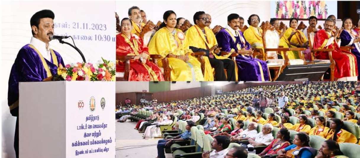
Degrees were conferred to 3448 students studied in Tamil Nadu Dr J.Jayalalithaa Music and Fine Arts University and affiliated colleges by the Hon'ble Chief Minister of Tamil Nadu / Chancellor on 21.11.2023.