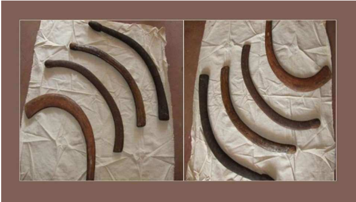
Various type of Boomerangs, Government Museum, Sivaganga