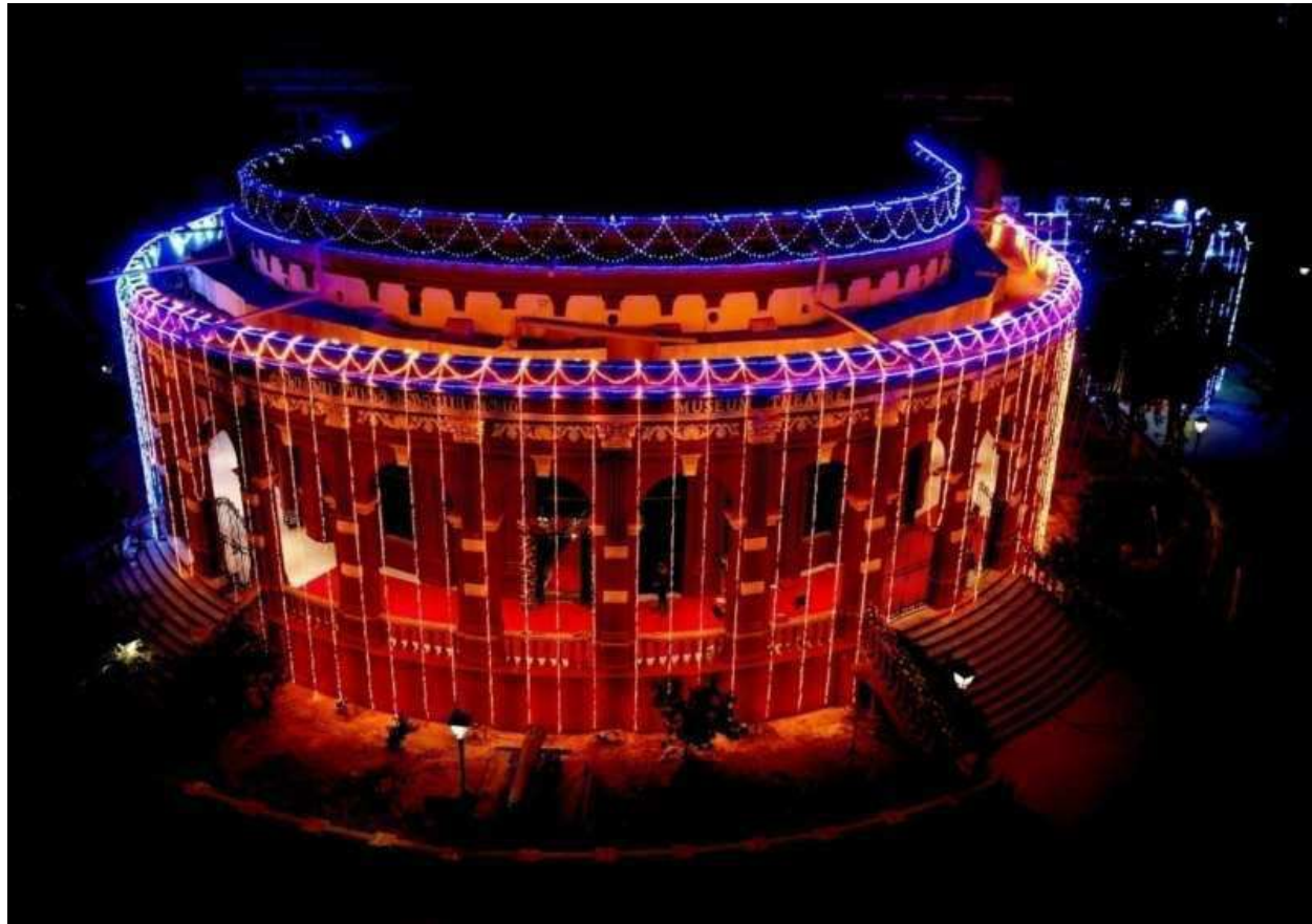
Illuminated external view of the Museum Theatre, Government Museum, Egmore, Chennai