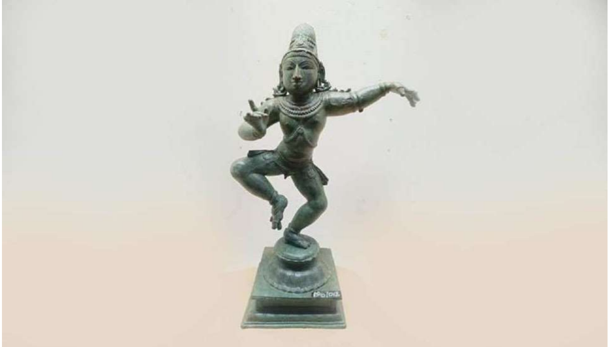
Bronze Icon of Tihirugnanasambandar, 14 th Century A.D.-Kudavasal, Government Museum, Tiruvarur