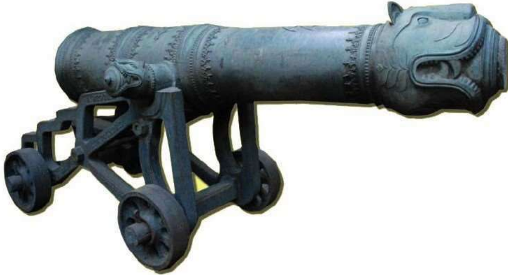
Cannon used by Tipu Sultan, Government Museum, Egmore, Chennai