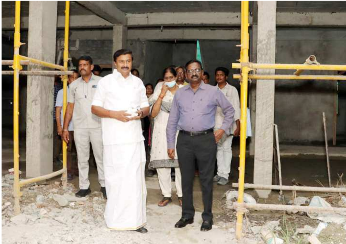
Hon'ble Minister for Tamil Development and Information along with Additional Chief Secretary to Government for Tourism, Culture and Religious Endowments Department inspected the new Administrative Building works on 30.06.2023, Government Museum, Egmore, Chennai