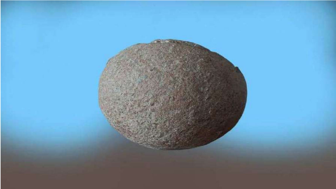
Fossilized Egg of a Dinosaur, Jurassic Period -140 million years ago, Field Fossil Museum, Ariyalur