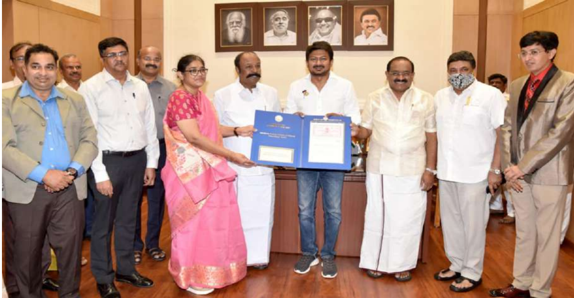
Hon'ble Minister for Youth Welfare and Sports Development launched the scheme of issue of duplicate family cards through post.