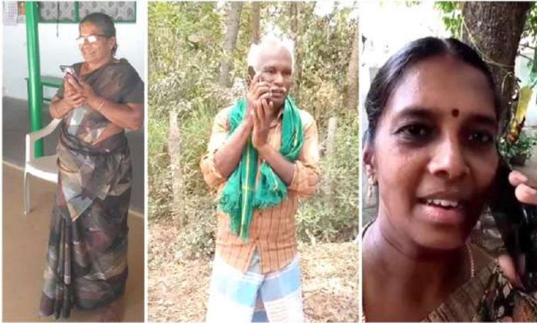
"Neengal Nalama" scheme launched by Hon'ble Chief Minister of Tamil Nadu. Hon'ble Minister for Food and Civil Supplies interacting with people about the reach of schemes of Food and Civil Supplies Department.