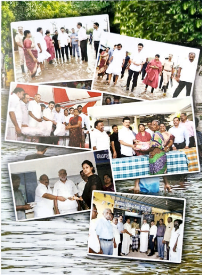
"Hon'ble Chief Minister's Relief to people affected by rain and flood". Hon'ble Minister for Rural Development and Hon'ble Minister for Food and Civil Supplies distributing 5 kg of rice in addition to Rs. 6000/- in Thoothukudi District.