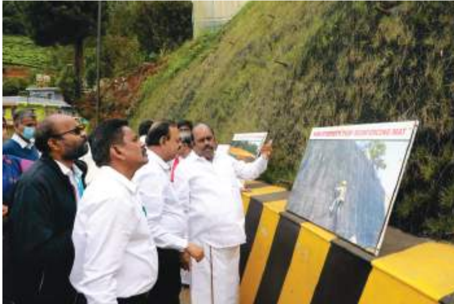
Controlling landslides using new technology in Udhagai Kothagiri Mettupalayam road - Inspected by Hon'ble Minister