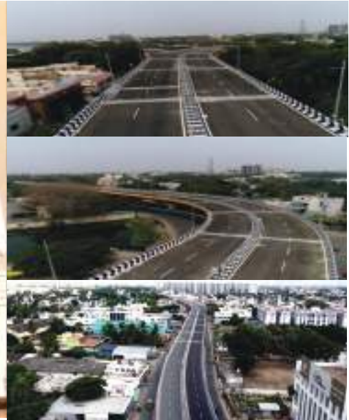
Hon'ble Chief Minister inaugurated Flyover at Ramanathapuram - Sungam Junction & at Goundampalayam junction in Coimbatore District on 11.06.2022 through Video - Conference