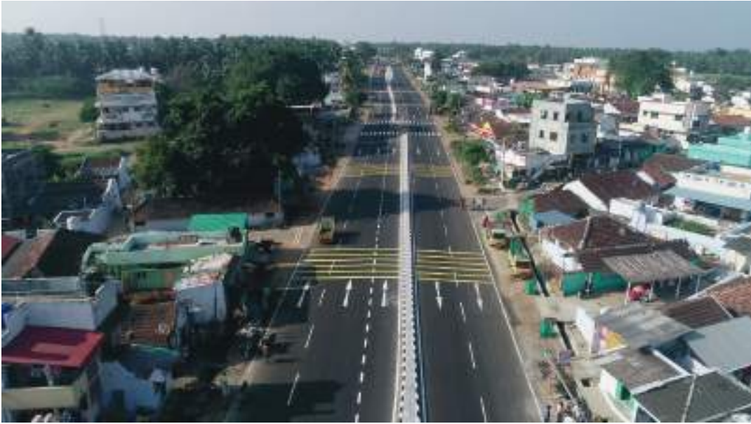
Road Safety Works at Avinashi-Tiruppur-Palladam-Pollachi-Cochin Road