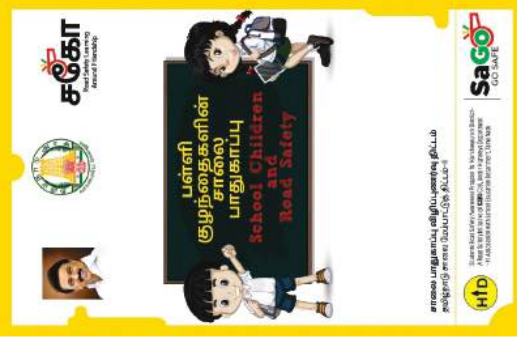
Road Safety Awareness Hand Book for School Children in Kanchipuram & Chengalpattu Districts - Released by Hon'ble Minister on 24.08.2022