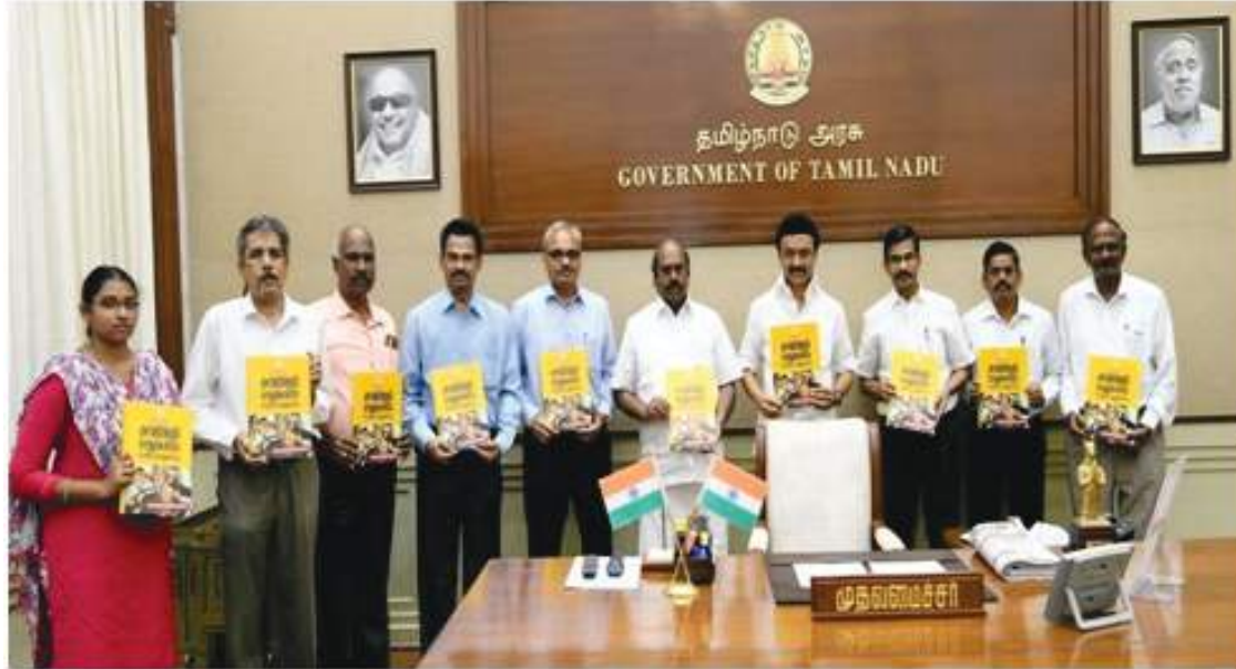
Hon'ble Chief Minister released Road Safety Awareness Guide on 22.08.2022