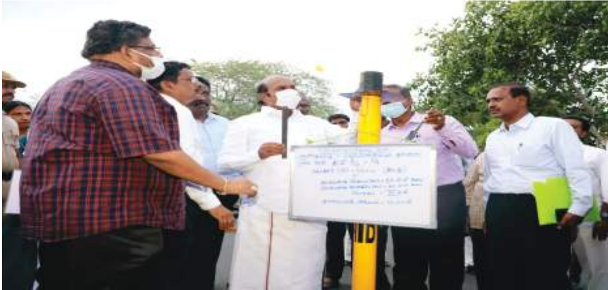
Andipatti - Jayamangalam Road, Theni District Road quality Inspected by Hon'ble Minister