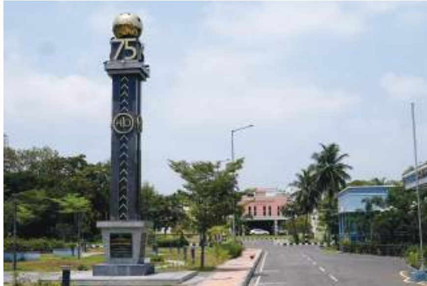
Platinum Jubilee Celebrations – Memorial Pillar opened by Hon'ble Chief Minister on 01.05.2022