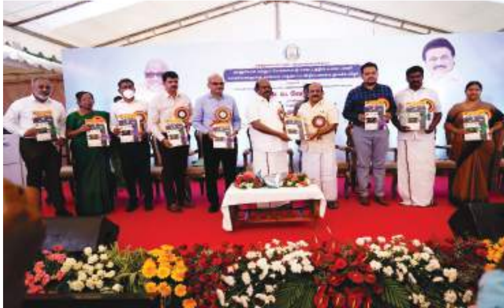
Road safety Awareness Campaign Programme in Kanchipuram and Chengalpattu Districts - Inaugurated by Hon'ble Minister on 24.08.2022