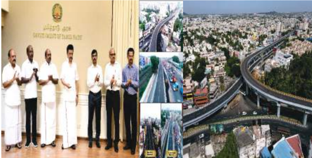
Grade Separator at Velacherry Vijayanagaram level -1 – Inaugurated by Hon'ble Chief Minister through Video Conference on 17.09.2022