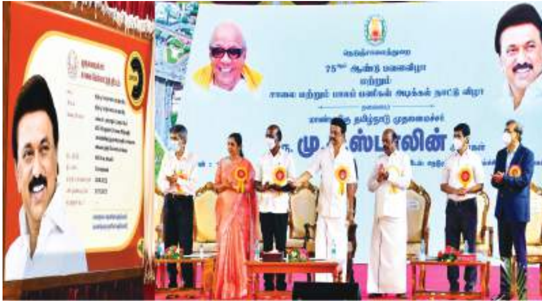
Hon'ble Chief Minister inaugurated Chief Minister Road Development Programme (CMRDP) on 01.05.2022 during Platinum Jubilee Celebrations.