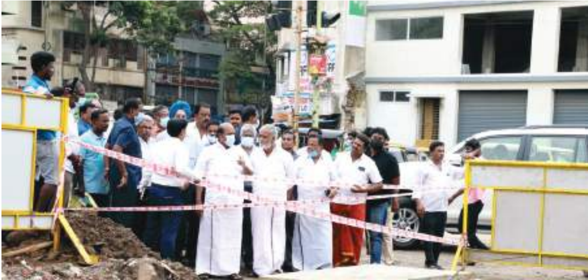
Flood Mitigation Works on Walltax Road Inspected by Hon'ble Minister