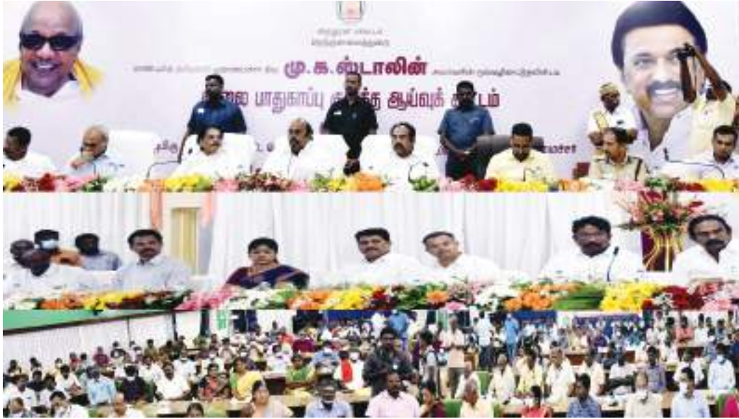
Road Safety Meeting in Virudhunagar District - Conducted by Hon'ble Minister for Public works, Highways and Minor Ports Department on 23.12.2022