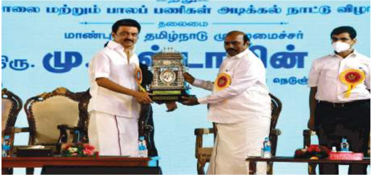
Platinum Jubilee Celebrations on 01.05.2022 - Memento presented to Hon'ble Chief Minister by Hon'ble Minister