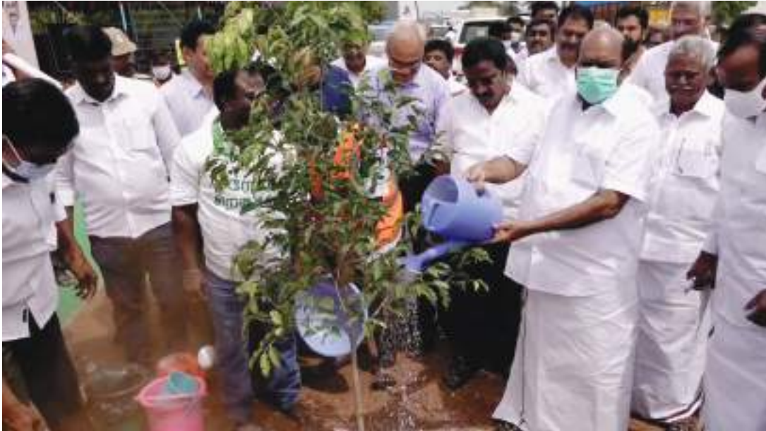
Erode Outer Ring Road-Avenue Plantation by Hon'ble Minister