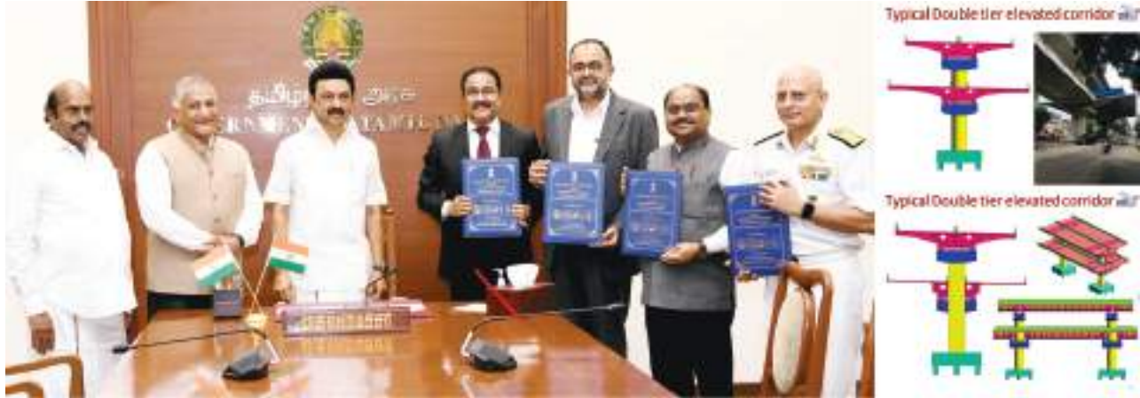
Two - tier elevated corridor from Chennai port to Maduravoyal- Memorandum of Understanding signed in the presence of Hon'ble Chief Minister on 16.05.2022