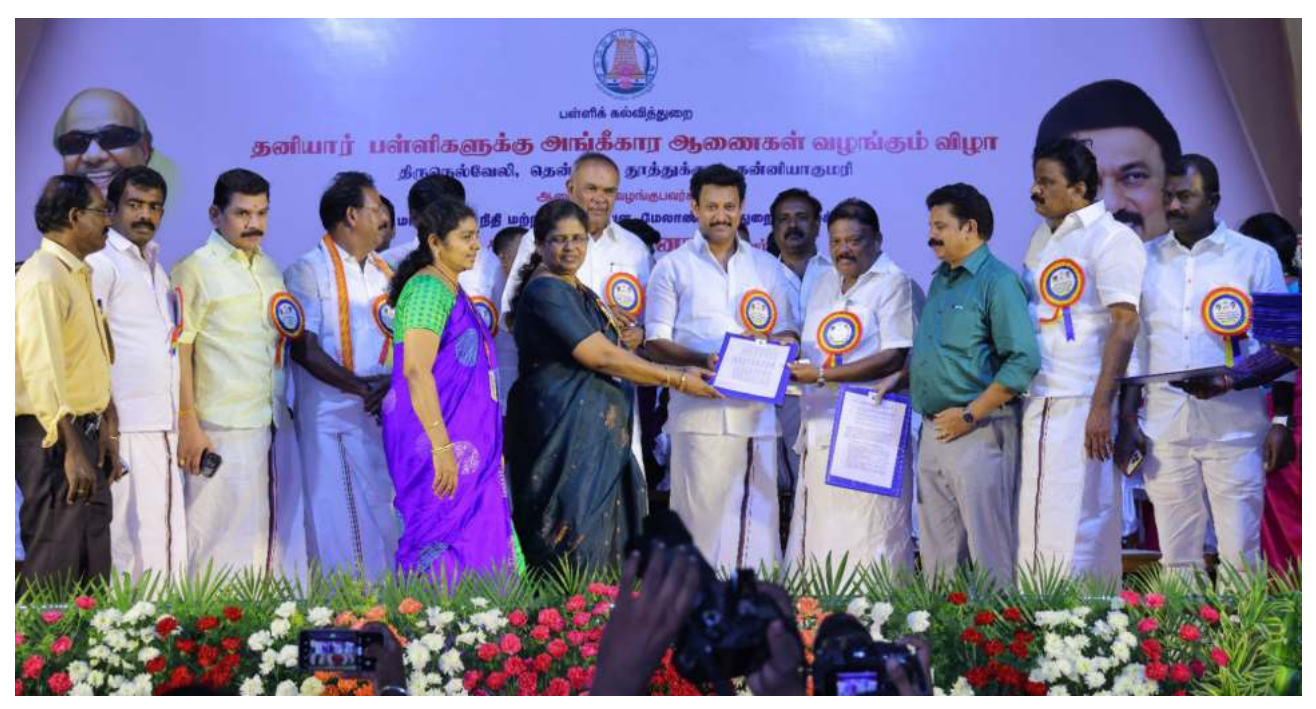
தனியார் பள்ளிகளுக்கு அங்கீகார ஆணைகள் வழங்கும் விழா