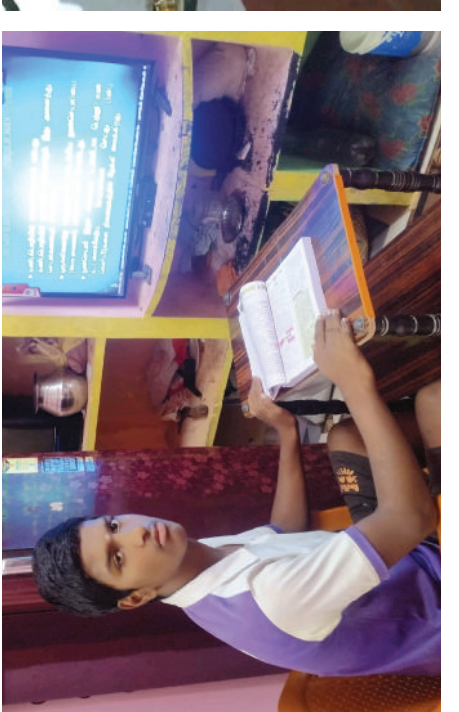
Students Learning the subjects through Kalvi TV.