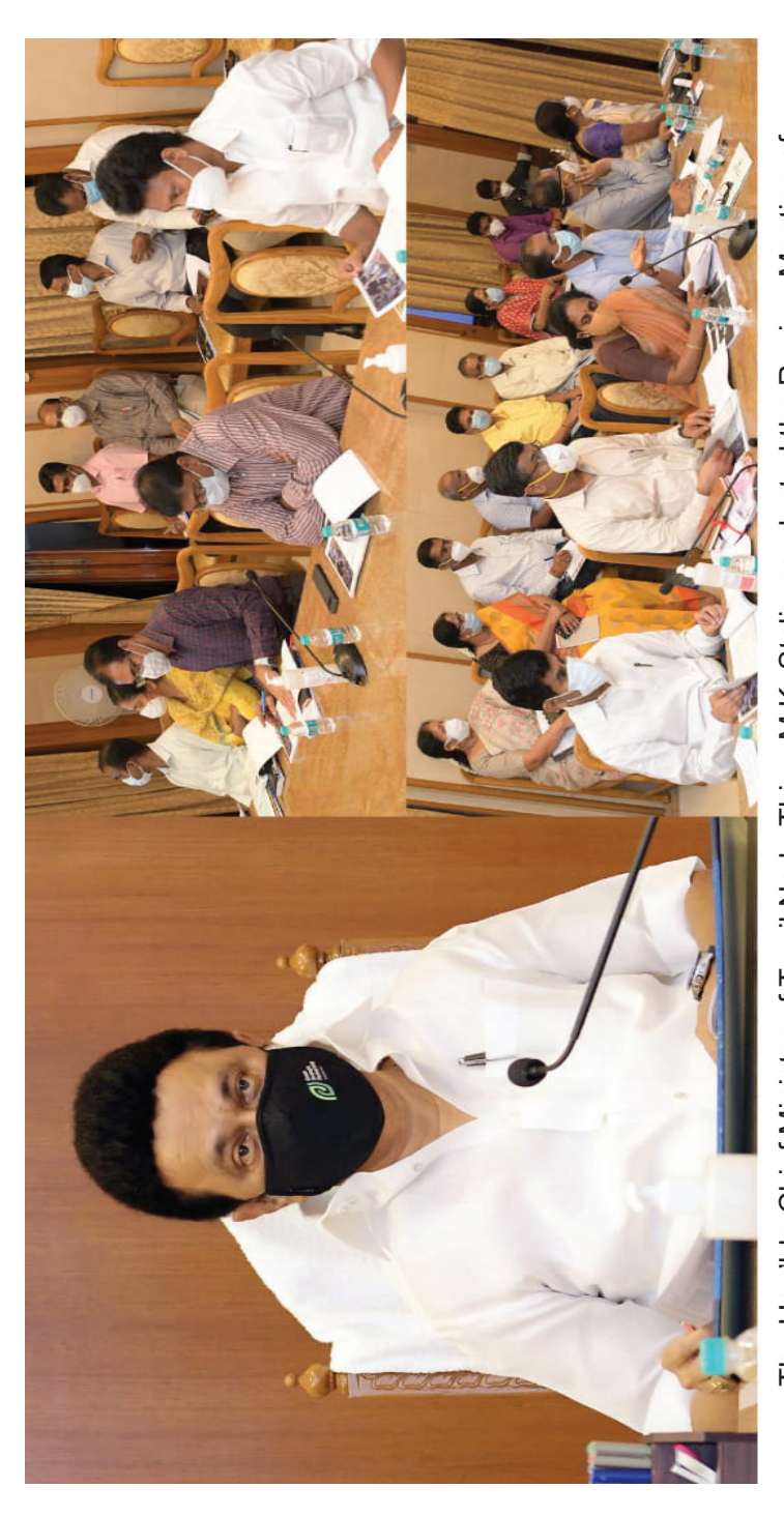
School Education Department with Hon'ble School Education Minister Thiru. Anbil Mahesh Poyyamozhi The Hon'ble Chief Minister of Tamil Nadu Thiru. M.K. Stalin conducted the Review Meeting of and officials at Secretariat on 1.7.2021.