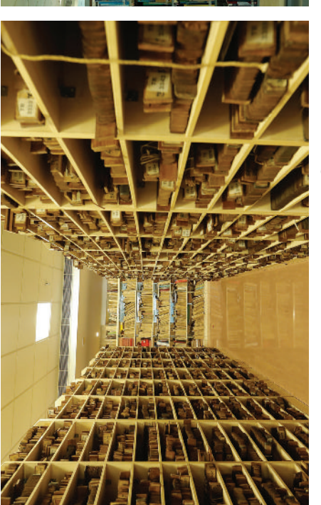
Anna Centenary Library, Kotturpuram, Chennai.