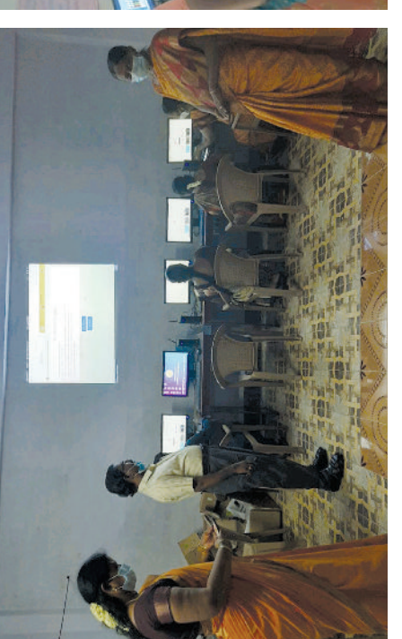
Training Conducted to Post Graduate Teachers through Hi-tech Labs.