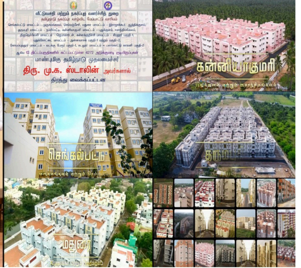
The Hon'ble Chief Minister has inaugurated 29,439 tenements in 96 schemes constructed at a cost of Rs.3248.74 crores during the last three years.