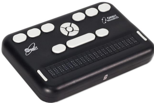
Electronic Braille Reader