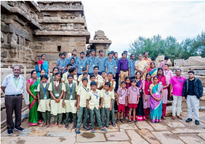
Children from Government special schools taken on a trip to Mahabalipuram as part of International Day of Persons with Disabilities.