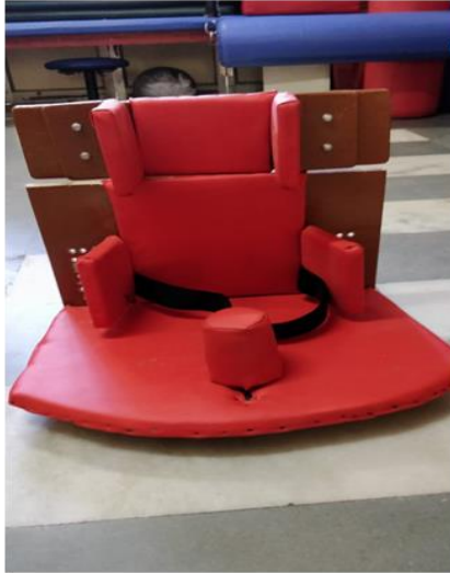
Corner Chair provided for children with Cerebral Palsy