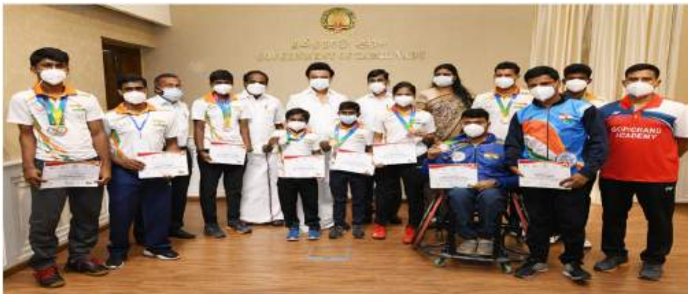
The winners and participants and also the coaches of Para Badminton 2021 held at Uganda met Hon'ble Chief Minister of Tamil Nadu Thiru.M.K.Stalin on 24.11.2021 and got his blessings.