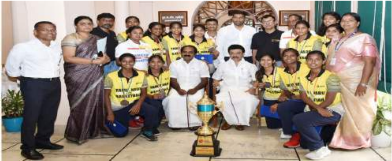
Hon'ble Chief Minister of Tamil Nadu Thiru.M.K.Stalin handed over a Cheque of Rs.12.00 lakh as High Cash Incentive to the Women's team of Tamil Nadu who won Bronze medal at the 71 st National Basketball Championship on 13.04.2022