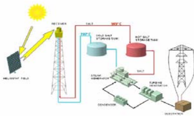
Figure 2. Solar TRES flow schematic